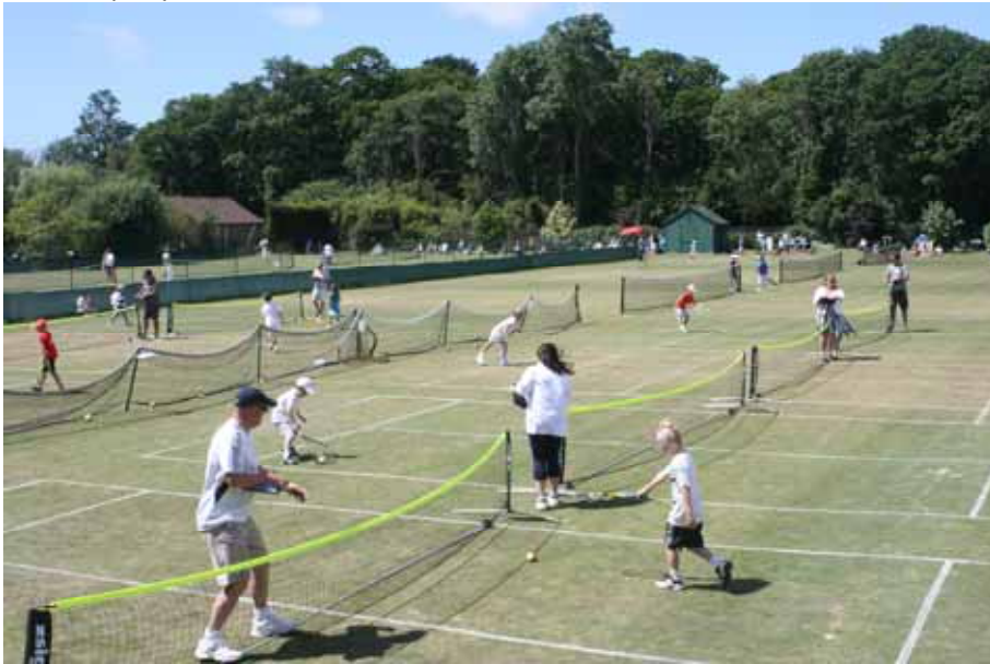
(Mini Tennis Grass Court Festival – July 2010)

Our comprehensive website offers the sponsor an excellent space in which to advertise their business. Links to the company's own website will be ensured to maximise awareness of the sponsorship.