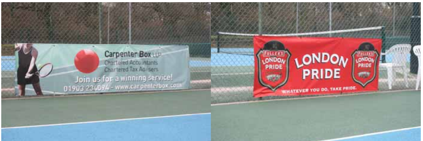
(Examples of banner advertising)