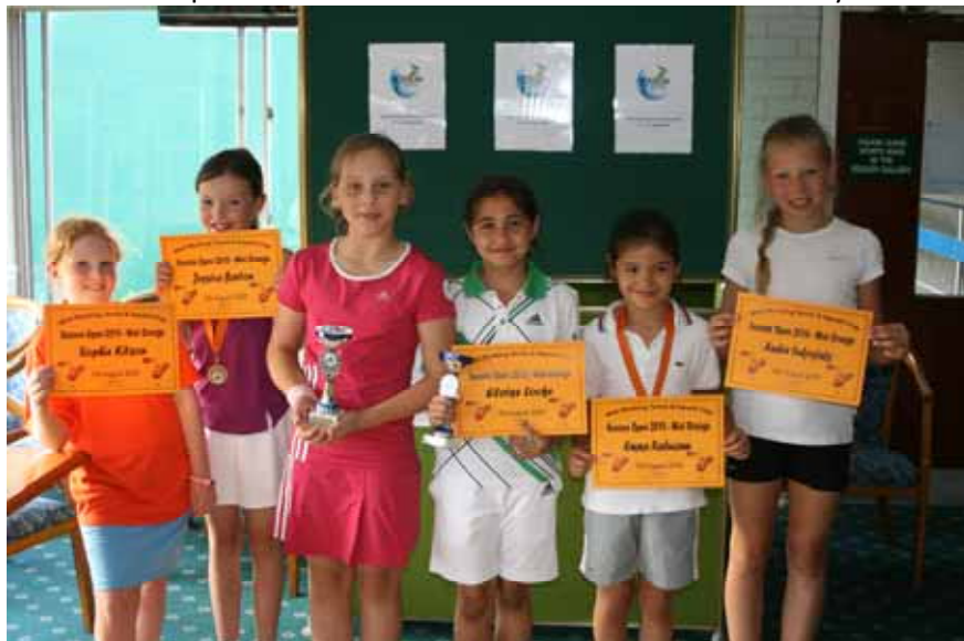
(Presentation for 9 and Under Girls at Sussex Open Championships 2010)

Our sponsor will have many opportunities to advertise at the club and during tournaments including promotion of the company's services or products. Banners can be strategically placed for maximum impact and will be used in photos that will be included in press releases. Our tennis tournament sponsor will be able to place banners, posters and brochures at the club throughout the year and use other promotional devices during our major events. The sponsor will of course be invited to attend our prize giving ceremonies to present trophies. All certificates that are presented to our mini tennis competitors will include the sponsor's name and logo. Staff that work for the sponsor and their families are welcome to visit any of the events.