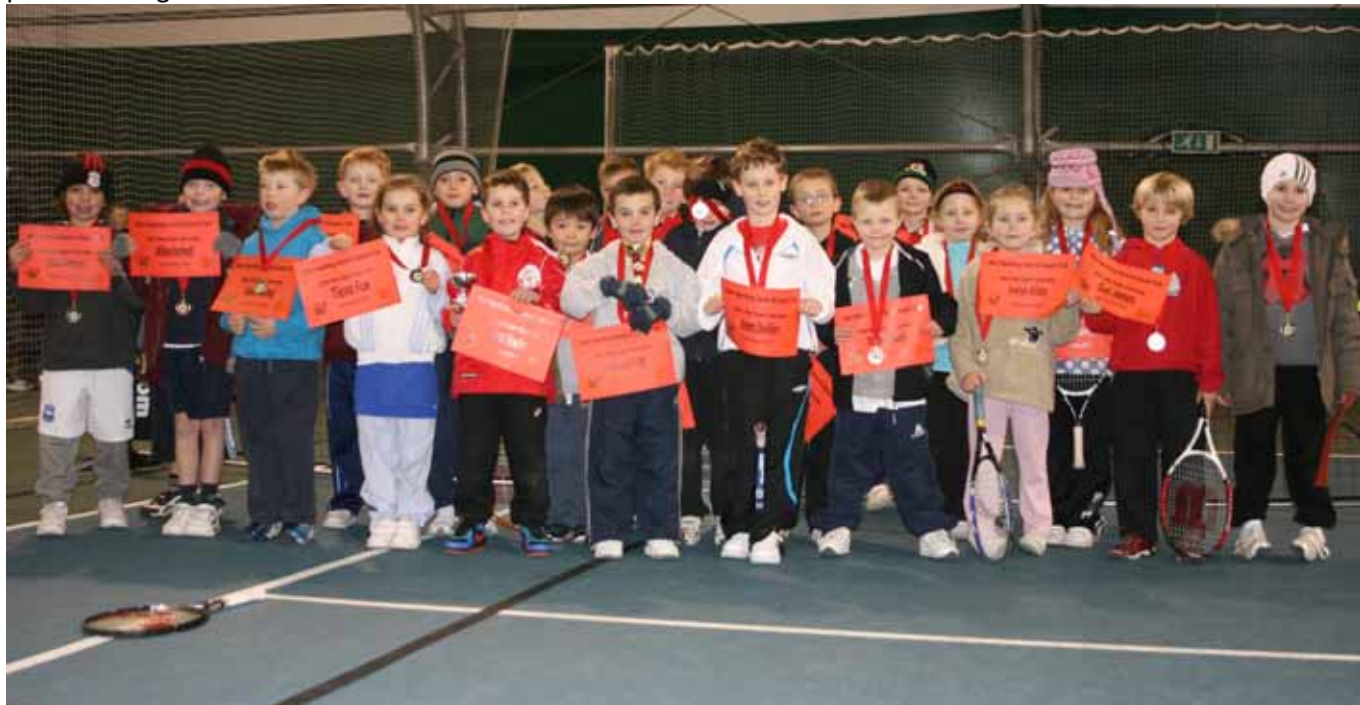
(Presentation at the end of a Mini Red Super Saturday Festival)

As the sponsor of the tennis series you will have naming rights to all the tournaments. By naming the events your company will be in the most prominent position for identification and will be recognised in all promotion and press coverage of the events.