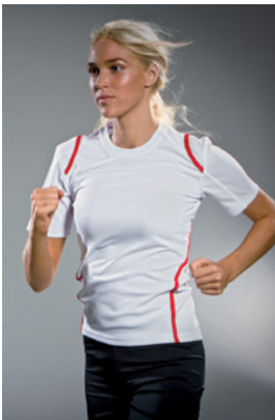
Gamegear - Cooltex

Description - 100% polyester with moisture management. Self fabric round neck. Contrast binding running over the shoulder down the back and round to the front finishing at the hem. Self coloured flatlock stitching down centre sleeves back and front. Twin needle cuffs. Straight front hem curved back hem.