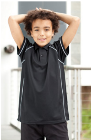
Finden & Hales

Description- Kids Piped Performance Polo